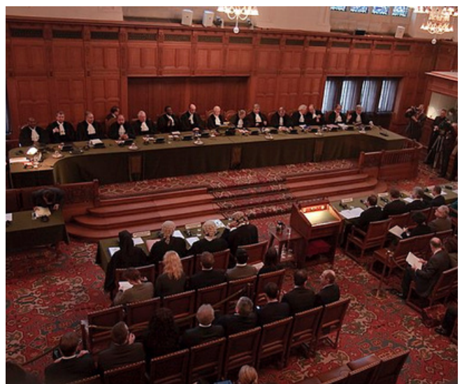
The International Court of Justice

Notwithstanding this challenge, the IDF have gone to extraordinary lengths, not seen in the history of modern warfare, to avoid casualties, even at great risk to their own soldiers.