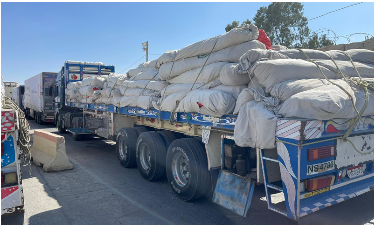
Trucks entering Rafah Crossing, carrying humanitarian aid, including food, medical supplies and water.

Throughout the period following the Hamas attacks, Israel has continued to allow inspected humanitarian aid to reach Gaza, including at least 4,632 trucks of supplies, through the Rafah crossing with Egypt, and in coordination with the United States, Egyptian authorities and the United Nations. In addition, Israel has opened a further entry point for humanitarian supplies, through the Kerem Shalom crossing.