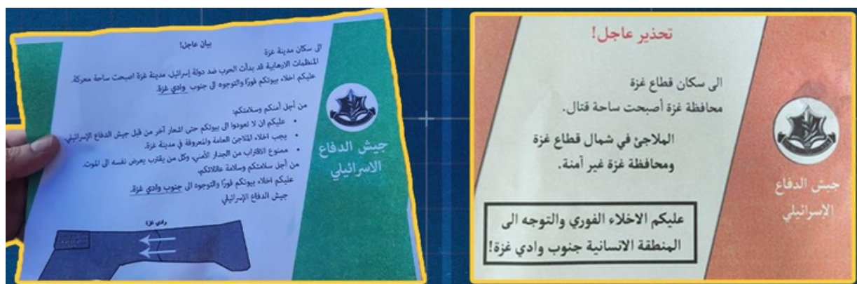
Letters from IDF to civilians in northern Gaza, suggesting to evacuate south

Throughout this campaign, Israel has issued repeated warnings for civilians in Gaza to evacuate defined areas, ahead of impending strikes. Many critics have charged that this amounts to 'forced displacement', which is a violation of international humanitarian law and a crime against humanity, pursuant to Article 7 of the Rome Statute . However, this is highly erroneous and a gross misinterpretation of both the law and Israel's intentions in providing such warnings.