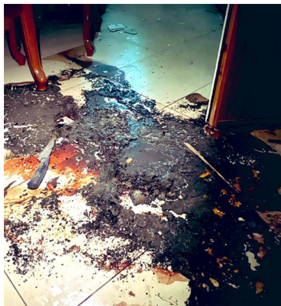
Bloodstained room in Kibbutz Be'eri, Southern Israel.

In short, what Hamas is carrying out is a triple war crime: using civilians in Gaza as human shields to attack civilians in Israel, while seeking the destruction of the Jewish state.